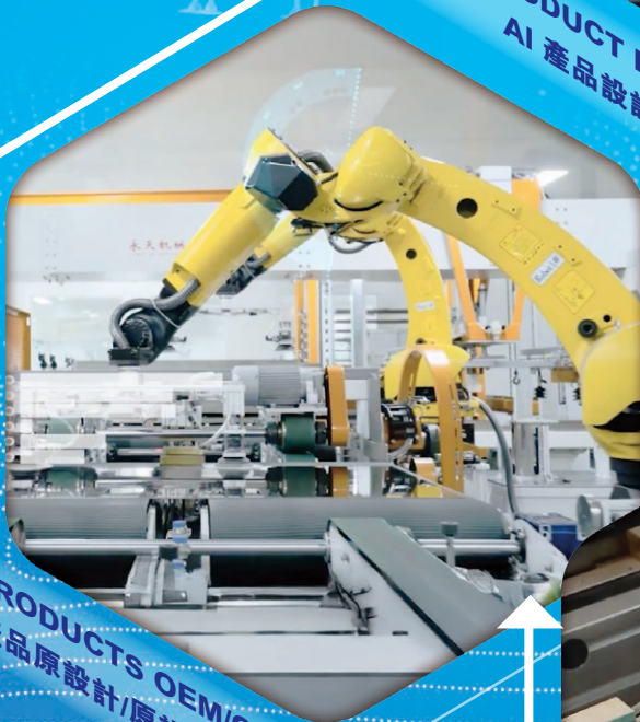
AI PRODUCTS OEM/ODM AI 產品原設計/原設備生產