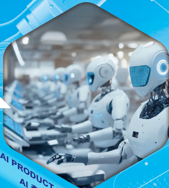
AI PRODUCT DESIGNERS AI 產品設計師