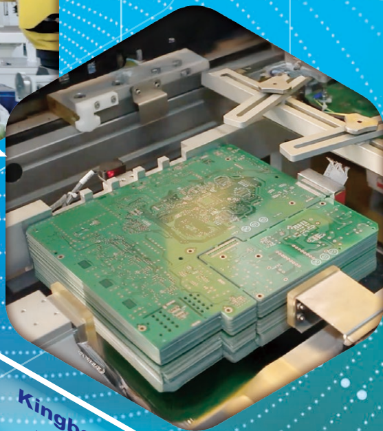
Kingboard Supply Chain 建滔產業鏈

AI Materials One-Stop Shop Solution AI 材料一站式服務方案